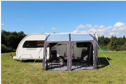
E-Sport Air 325 Outer Front Height: 180CM Adjustable Height: 235-250CM